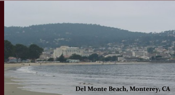
Del Monte Beach, Monterey, CA

Practices held on the picturesque Monterey Beach, next to Monterey Bay Kayaks on Del Monte Avenue.