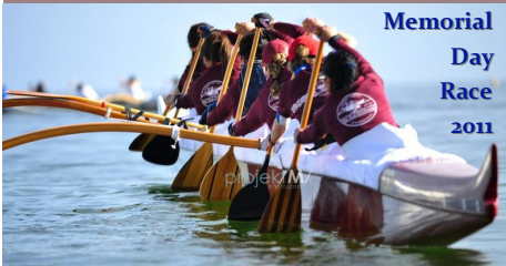
Memorial Day Race 2011